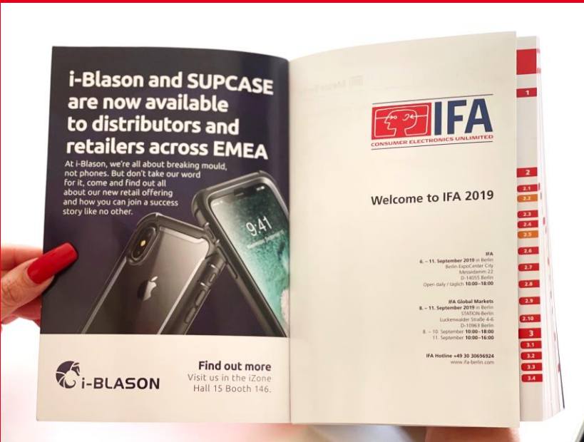
4th Cover Page